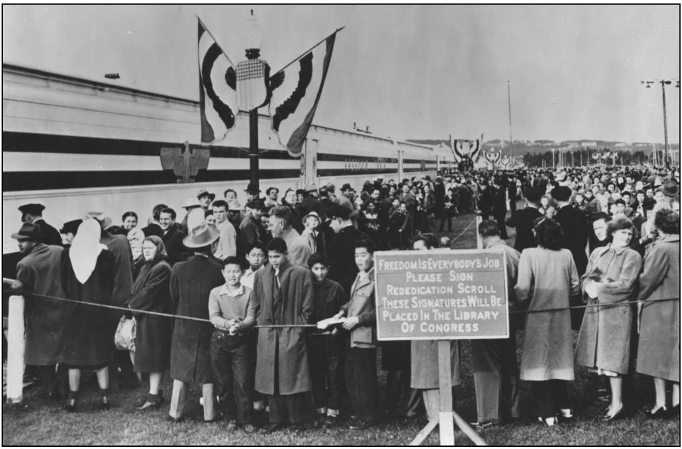
Waiting to see the Freedom Train in San Francisco

The sign says “Freedom is Everybody’s Job” “Please Sign Rededication Scroll”