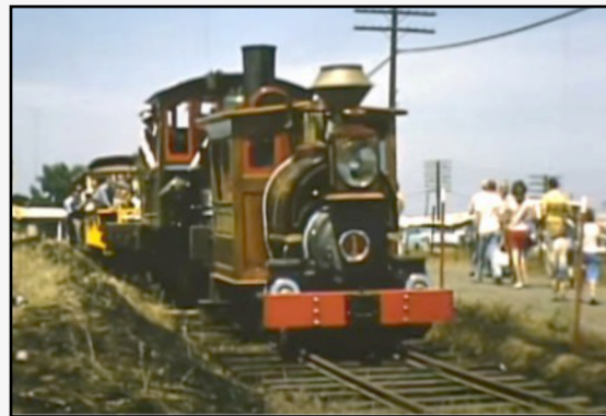
Antelope & Western #1 appears in our October program featuring two vintage narrow gauge railroads. See page 2 for details.